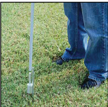
Slide mast bottom onto top of stake.