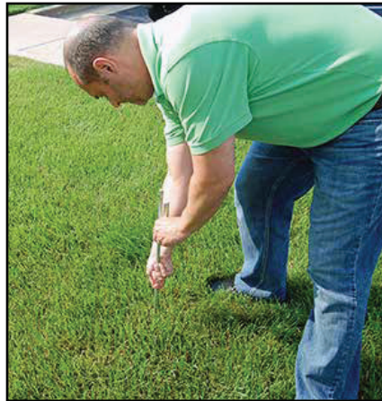
Place stake into the ground. If required, a hammer can be used to gently tap the stake in.