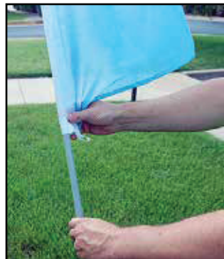
With mast all the way into the banner pocket, pull banner down.