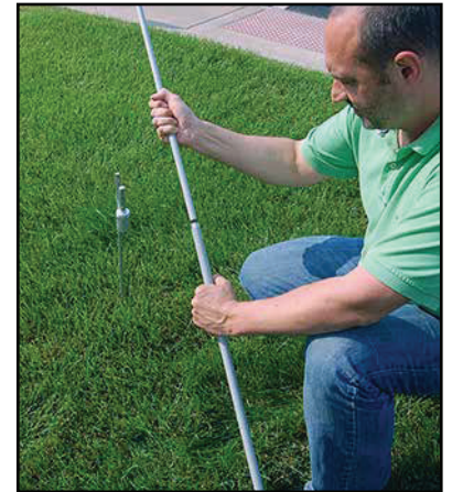
Assemble mast poles. Thickest section into thinnest.