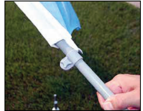
Hook banner loop onto the hook on the adjustable sleeve. Tighten sleeve until desired tension.