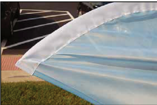
Slide mast into pocket at bottom of banner until tip of mast meets end of banner pocket.